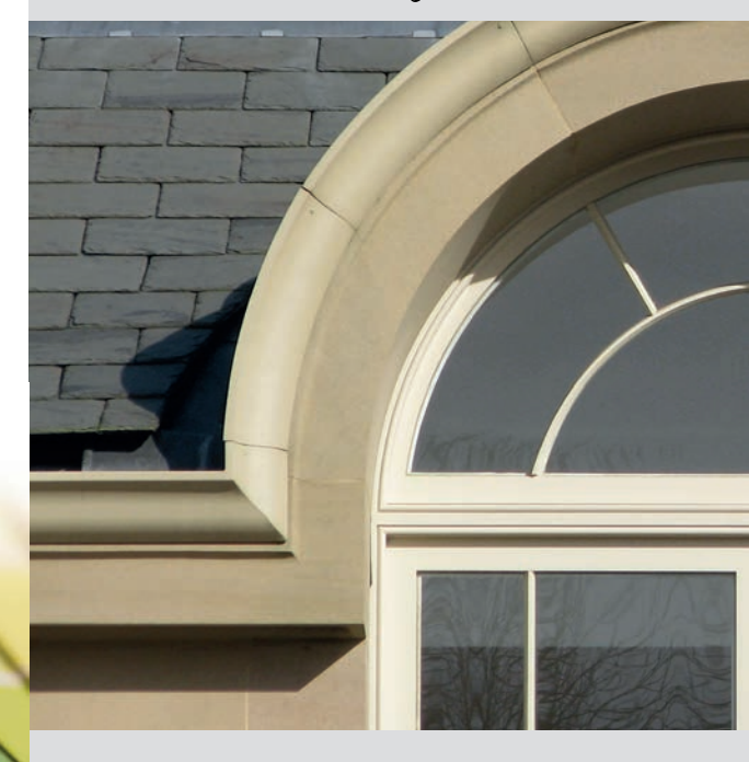
Blend in with the stonework:

Moulded OGEE Gutter with a finish from our Stone Effect Range.